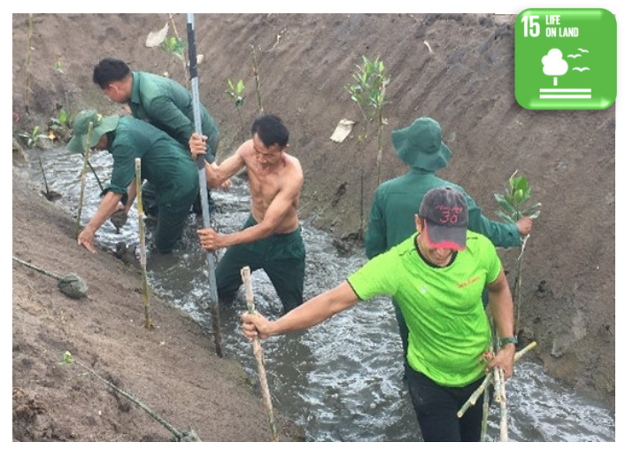
Landscaping staff members planting 200 seedlings of the <u>Rhizophora mucronata</u> and <u>Rhizophora apiculata</u> species in honor of Her Majesty Queen Sirikit's Birthday and Mother's Day in Thailand on 12<sup>th</sup> August.

Commemorating World Environment Day on 5th June, Chiva-Som launched the next phase of Krailart Niwate development expanding the reconstructed wetland area by 50% on an adjacent, barren floodplain. The expansion of the mangrove forest area is located on a six rai of land west of the Buddhist temple, Wat Khao Krailart. An integrated network of 26 canals were built to provide a constant supply of water from the existing canal that leads to the Gulf of Thailand.